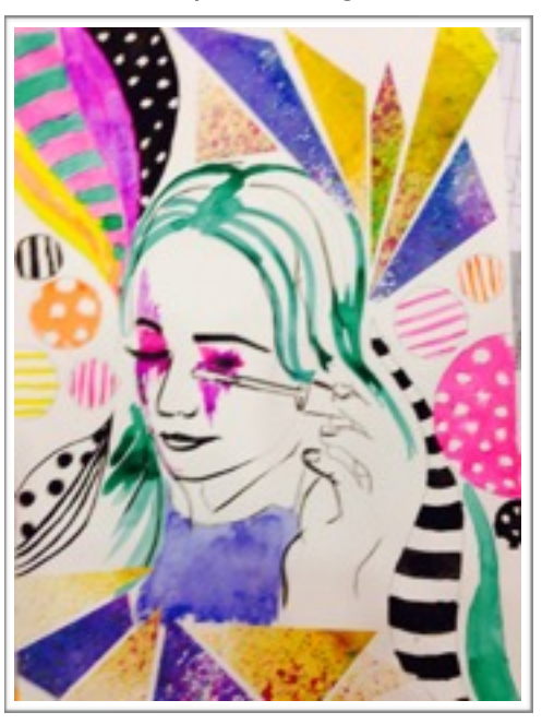
A colourful collage by Olivia Robinson